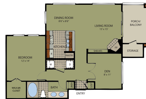
SAPPHIRE • 914 Sq. Ft. One Bedroom / One Bath + Den