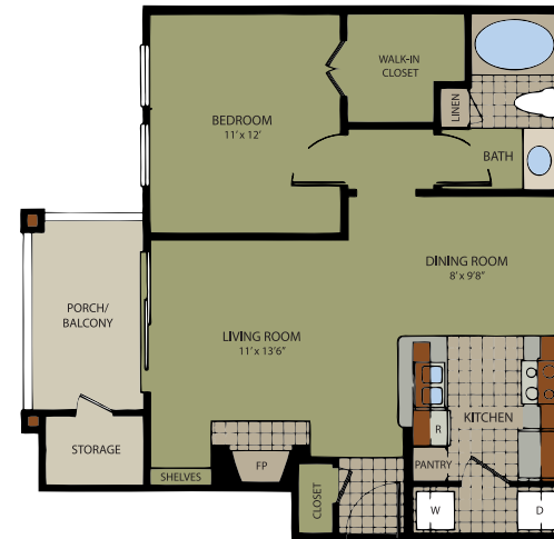
RUBY • 698 Sq. Ft. One Bedroom / One Bath