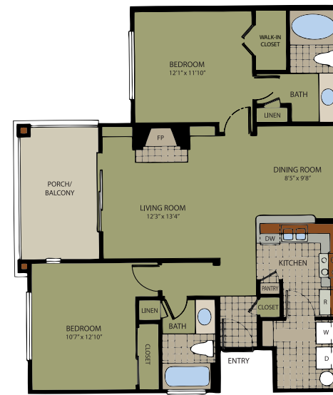
PEARL • 1,022 Sq. Ft. Two Bedroom / Two Bath