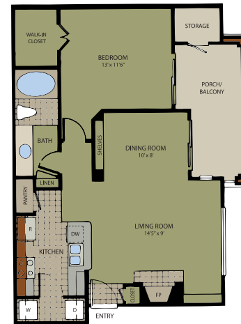
OPAL • 785 Sq. Ft. One Bedroom / One Bath