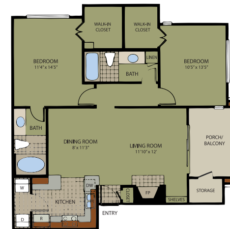
DIAMOND • 1,073 Sq. Ft. Two Bedroom / Two Bath