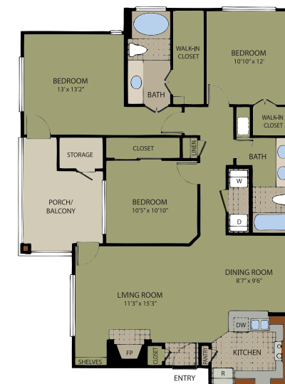
EMERALD • 1,371 Sq. Ft. Three Bedroom / Two Bath